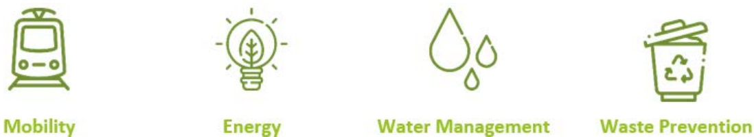
Figure 2: INCIRCLE main areas of action

Tourism is an inherent part of the territory, not just an isolated economic sector, but it is also part of a multiple and cross-cutting reality affecting the whole of society and affects its economic, social, cultural and territorial life in numerous aspects. Therefore, policies related to these areas may not always be part of touristic offer, because they may not refer directly to the touristic sector. By the way, in the areas within the INCIRCLE programme, actions related to these areas have always an impact on tourism, because this sector is the main economic activity, or one of the most relevant, for the territory.