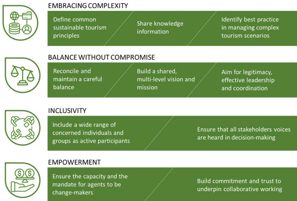
Figure 5 Effective governance principles

Sustainable tourism governance needs to reach and maintain a careful balance capable of reconciling the environmental, economic and sociocultural dimensions of sustainability and circularity and to adopt coordinated strategic planning and management of tourism activities and impacts.