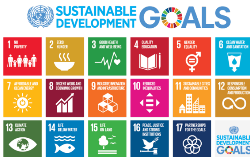
Figure 2: UN Sustainable Development Goals

In particular, contribution is requested to the tourism sector to meet the SDG n. 12 which aims at ensuring sustainable consumption and production patterns (SCP).