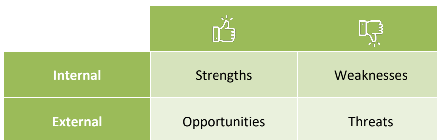
Figure 4: SWOT Analysis scheme